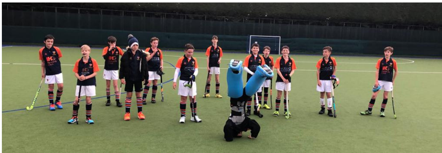
U14 Boys Oranges celebrating their victory vs Sevenoaks

The latest news and updates from Old Cranleigh Hockey Club